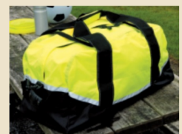
Reflective Holdall Enhanced Yellow with reflective tape Code: EV091