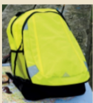
Large Reflective Backpack Enhanced Yellow with reflective tape Code: EV090