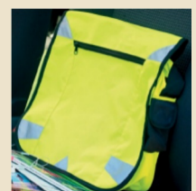
Reflective Messenger Bag Large zipped pocket section & main compartment Mobile phone pocket Enhanced Yellow Reflective tapes Code: EV093