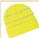
Enhanced Viz Knitted Hat with reflective stripes Fl. Orange, Fl. Yellow, Black, Navy Code: BC042