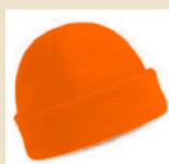
Suprafleece Ski Hat Fl. Orange, Fl. Yellow (other colours also available) Code: BC243